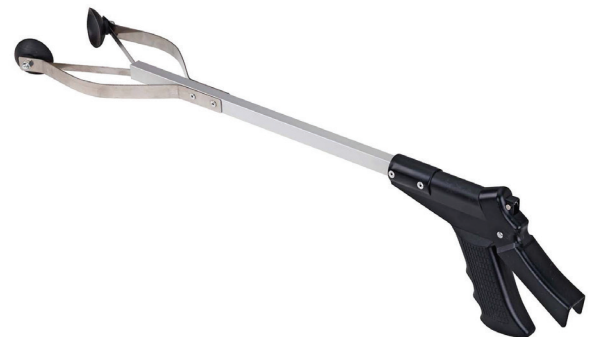
Reacher or Grabber.