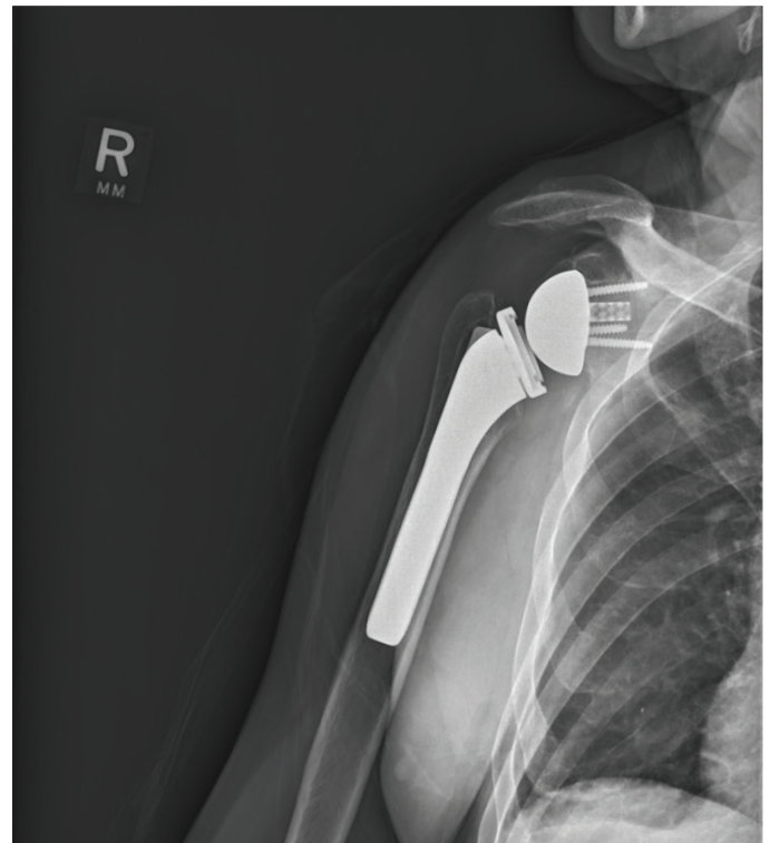
Reverse Shoulder Replacement. Courtesy of the author.