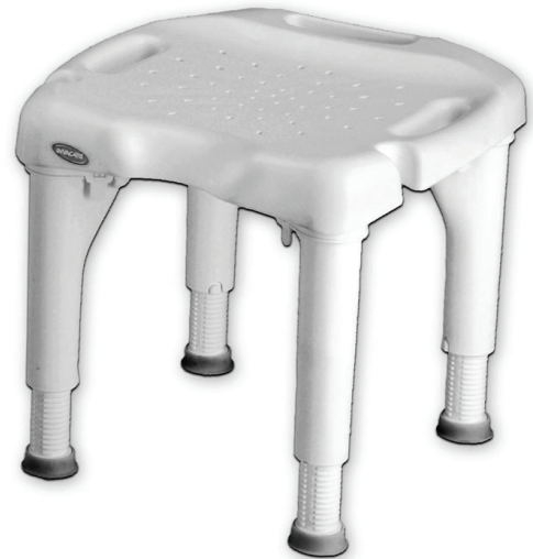
Shower Chair.